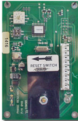
w/ Reset Switch labeled

Note that the two Loop Boards on the bottom are older and have no Reset pushbutton. If your Fast Track timer has one of these older Loop Boards the entire timer must be powered down and then back up to reset the Loop Board.