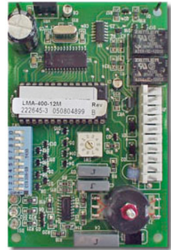
no Reset Switch