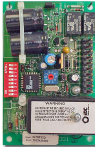
no Reset Switch